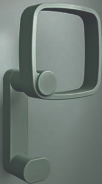
Finitura / Finish: T3 - Verde Malachite Silk Effect