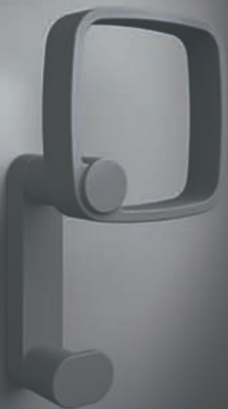
Finitura / Finish: T7 - Cool Grey Silk Effect