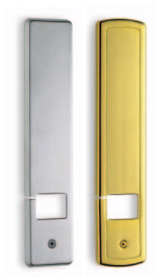
Cromat . Mat chrome